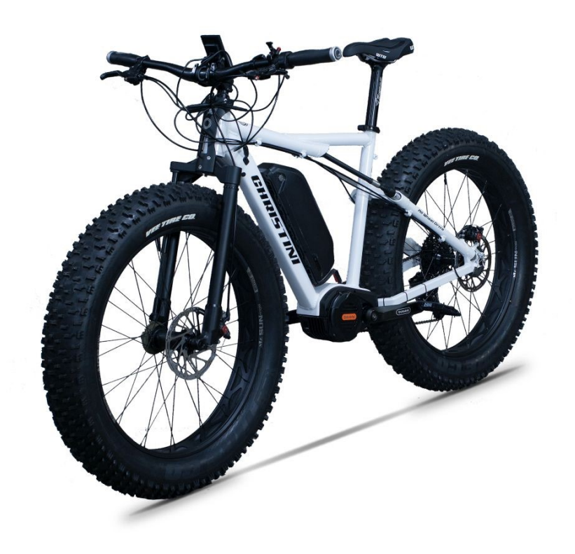
2 2022: US Military adapts the CHRISTINI AWD E-Bikes for Special Forces operations